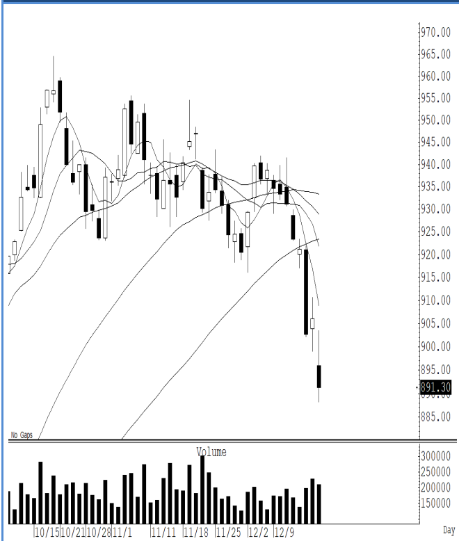
S50Z24 (Close 891.30 Chg -14.70)